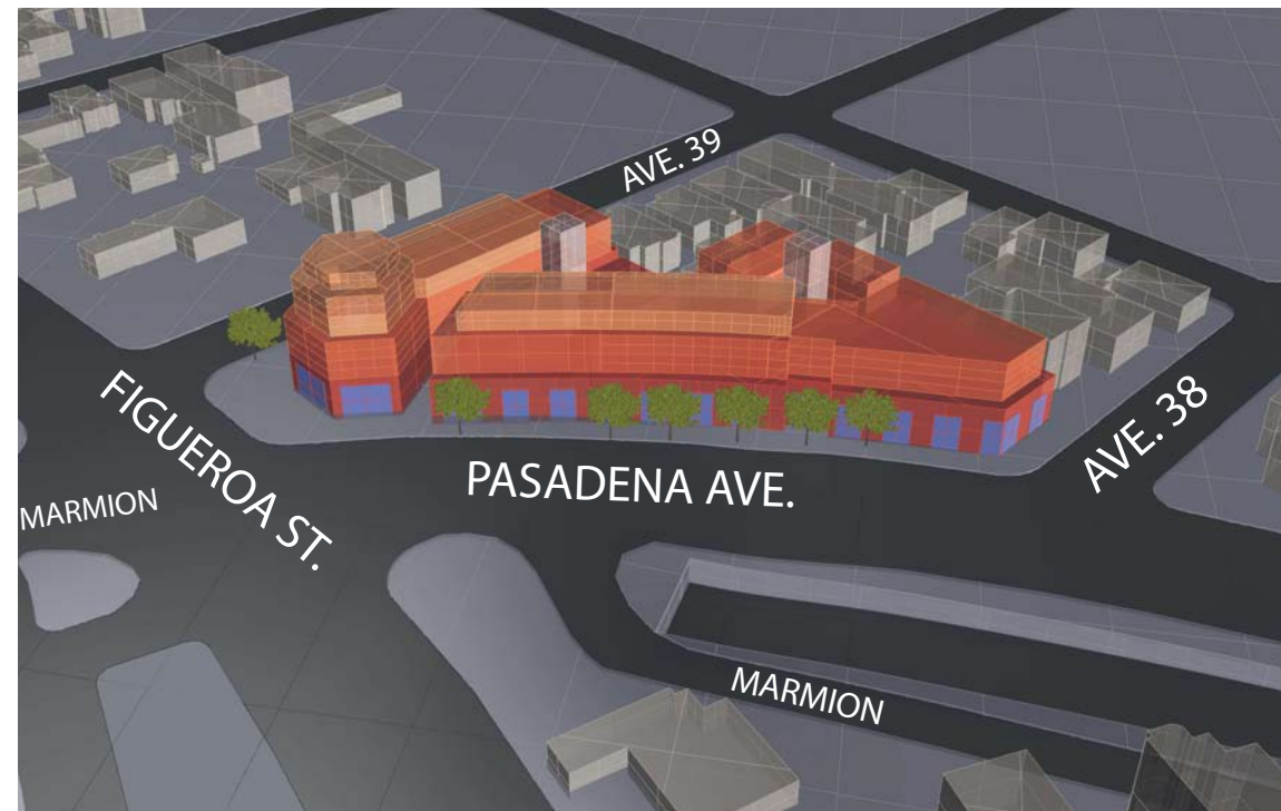
BIRD'S EYE VIEW TO EAST