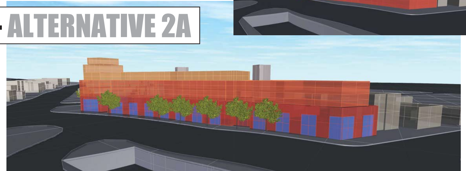
A VIEW TO SOUTH - CORNER OF FIGUEROA & PASADENA